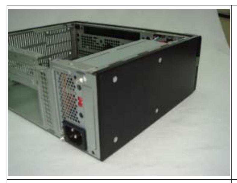
(5) Use 4 pcs of M3*0.5p*L5 Flat Head Screw to secure the 2.5" HDD from the external side of Chassis.