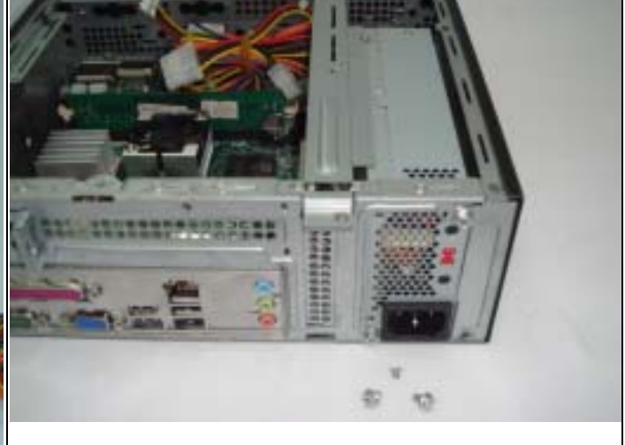
(1) The Fixture Bracket is not required for the installation of the (2) Position the Power Supply in the case, - FSP150-50AF Model Power Supply. (2) Position the Power Supply in the case, - Use 2 pcs of 6-32*L6 Hexagon Head Screw

Take care not to break off the 'Punched-but-not-perforated' Bracket on the Rear Panel.