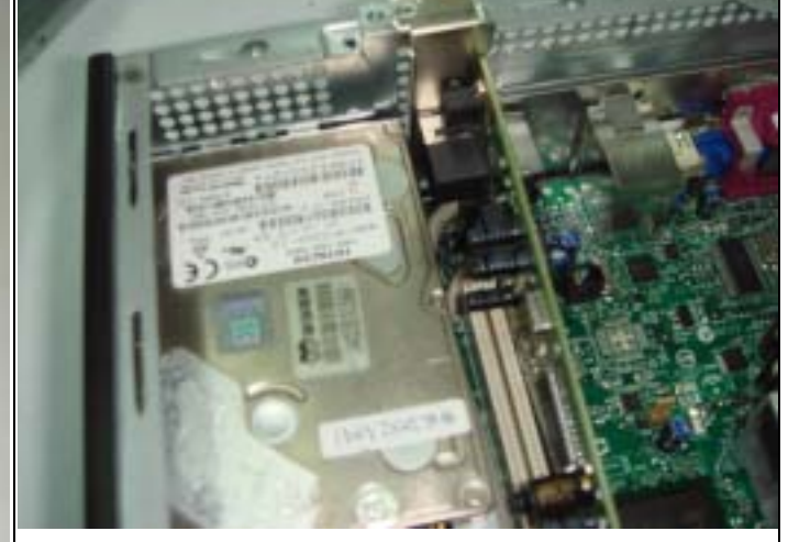
(7) Position the assembled DC to DC Converter module into the case and, -

Use 3 pcs of 6-32*L6 Hexagon Head Screws to secure the module from the Rear Panel.